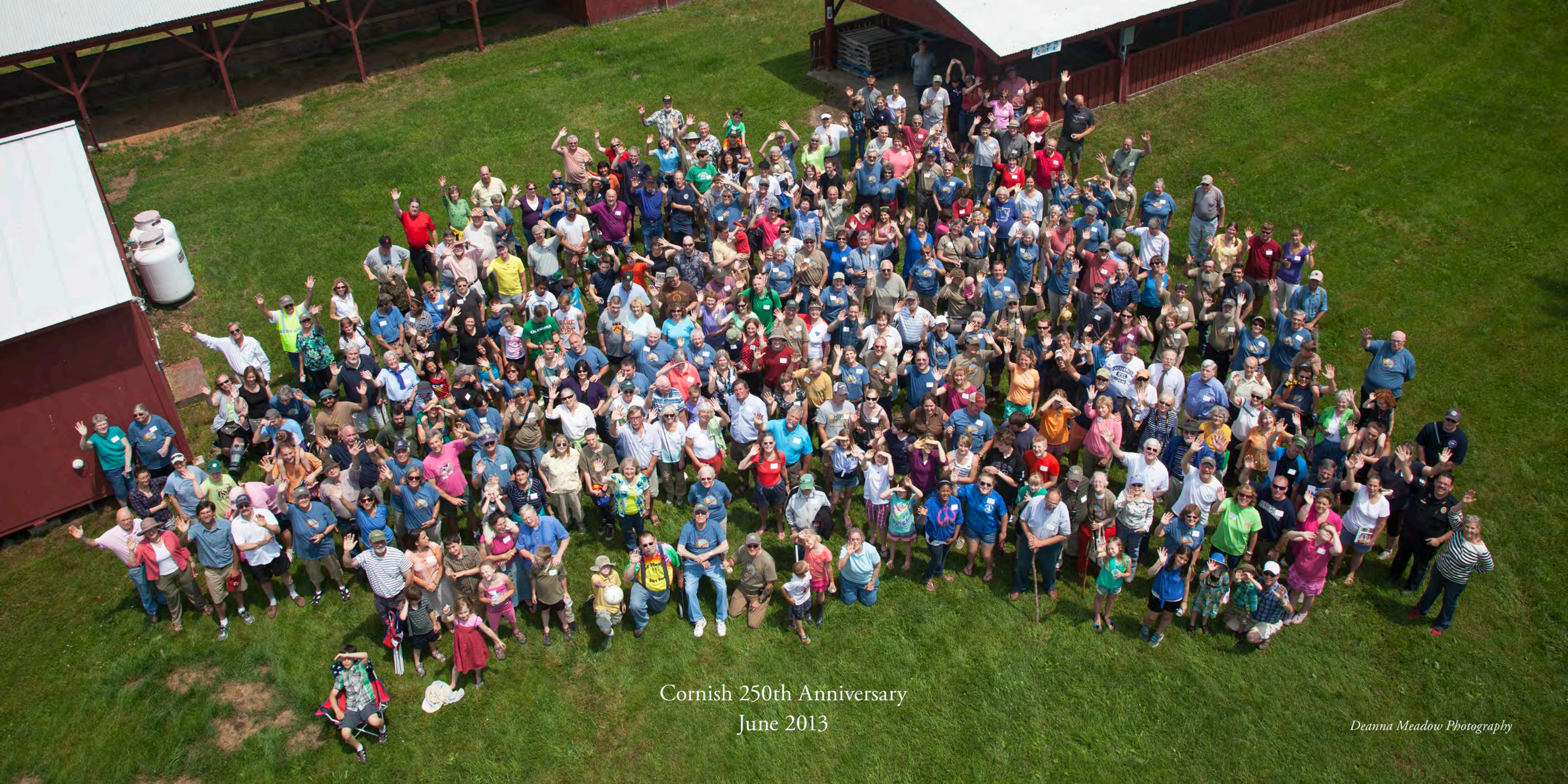
Cornish 250th Anniversary June 2013